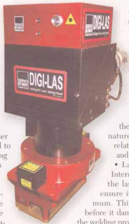
FIGURE 1. Servo Robot Corp. Digi-Las™ intelligent laser welding head.

• Joint tracking sensing. Seam tracking incorporates the use of a camera sensor to measure, correct, and maintain the proper laser beam focus position to keep it