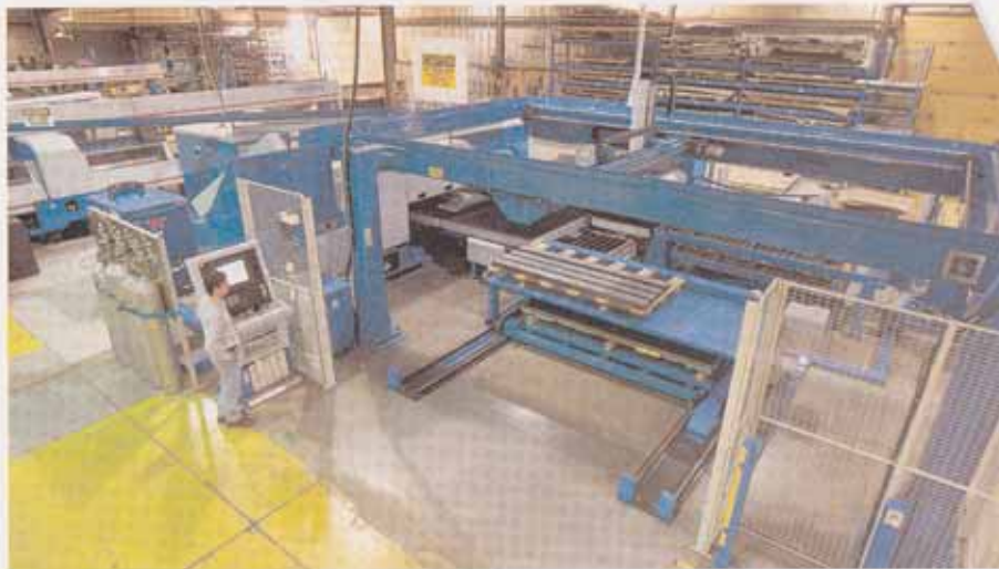
BMP is running many different types of metal, including stainless steel, aluminum, and carbon steel, in various thicknesses on the LPE. The company also is burning some high-strength alloy steel that would be difficult to punch.

"The LPE opens whole new avenues to us in terms of flexibility and capacity, where we are not saying 'no' or 'maybe' to our customers," contends Bedard. "It is a positive move, especially when you consider what we