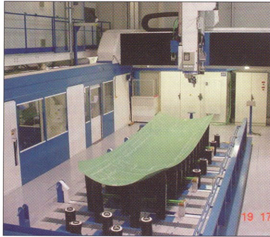
FIGURE 3. Le Creneau Industriel system.

The system, which incorporates a Coherent 100W CO 2 laser and a Haas Laser Technologies Inc. Optical Laser Wrist is designed with a large 9 m × 4.5 m × 1.5 m work envelope moving gantry. It incorporates a Siemens 840D CNC with linear motors to provide high accuracy with speeds up to 60 m/min. The curved component to be laser processed is placed on a 99-peg support fixture where each peg has its own independent numerical axis to form the precise 3D shape required. The opti-